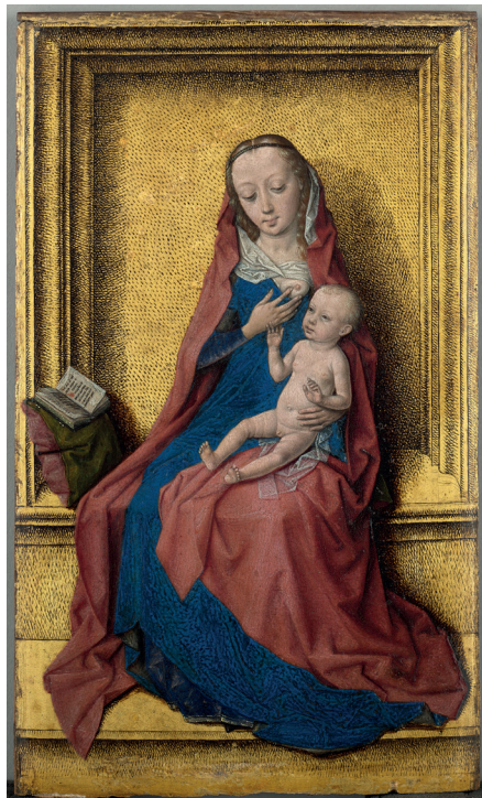
Madonna and Child seated in a stone alcove, Dieric Bouts, 1468-1475 Beyoncé at the 59th Grammy Awards, 12 February 2017

Dieric Bouts painted various depictions of the Madonna and Child. These iconic images still inspire today.